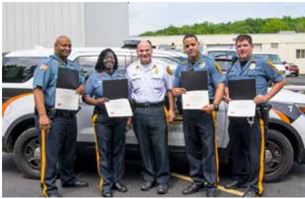
William Paterson officers receive WP Pride Care Awards for their service to the University.