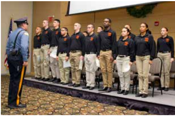
WP Pre-Police Academy Students

University Police will immediately notify the campus community or appropriate segment of the campus community upon the confirmation of a significant emergency or dangerous situation involving an immediate threat to the health or safety of students or staff occurring on the campus. In the event that University Police decide to notify a segment or segments of the campus community, the choice of this/ these segment(s) will be made based on the potential for the emergency to affect the individuals who are selected.