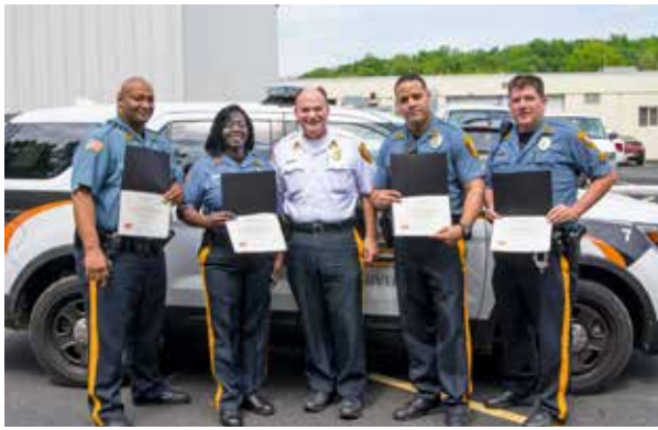
William Paterson officers receive WP Pride Care Awards for their service to the University.