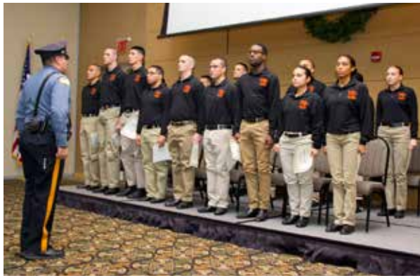
WP Pre-Police Academy Students