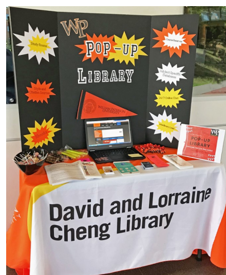
Keep an eye out for the Pop-up Library around campus.

Pop-up Library at University Hall will continue in Spring 2019. Stop by on a Thursday to learn more about how to effectively use library resources and services!