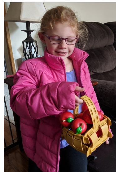
1st grade student demonstrates the completed Basket STEM project from Little Red Riding Hood.