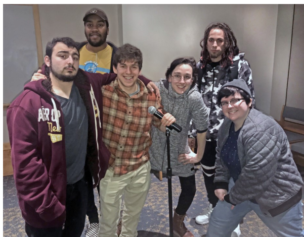
Members of the WP Comedy Club provide comedic stress relief during final exams in the Library

The Library's commitment to lifelong learning recently led to the development of a new Alumni Resources guide. The guide provides an abundance of scholarly resources freely available and accessible to WP alumni. Several librarians worked with the Alumni Relations office and hosted a webinar to present the online resource guide, instruct alumni on its value and use, and answered questions about the research and learning needs of Pioneer alumni. The resource guide can be accessed by selecting Research Guides on the Library homepage ( wpunj.edu/library )