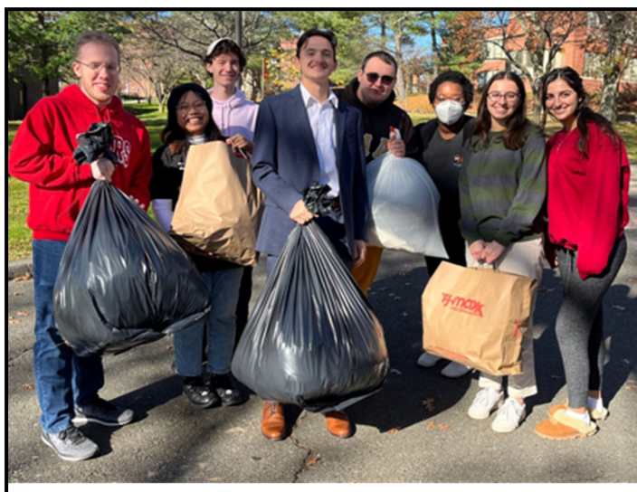
When it comes to civic engagement, Honors students are leaders on campus!

Civic Engagement is one of the core values that is inherent in WP's mission statement. The Honors College fulfills this mission by helping students along the path to leading an enriched, accomplished, and compassionate life.