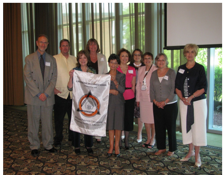
PDS banners presented to West Milford superintendent, teachers, and administrators