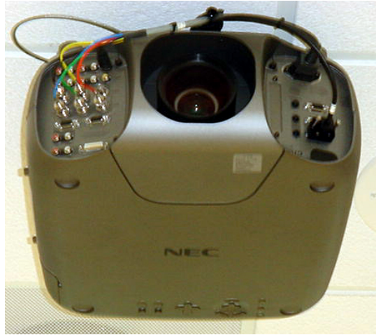
Projector Operations (Tiered Classrooms)