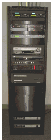
Equipment Tower, located in the room's AV Closet

Step 3: Turn the VCR power on. The VCR is located on the equipment tower in the AV Closet.