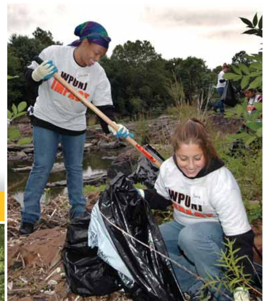
William Paterson students at work at the Great Falls