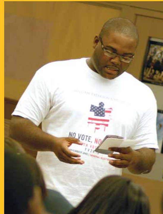
A University student discussing voter registration at Paterson's Kennedy High School