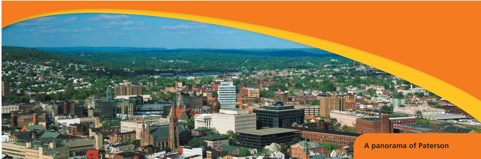
A panorama of Paterson