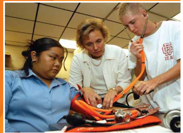
CPE's summer nursing camp