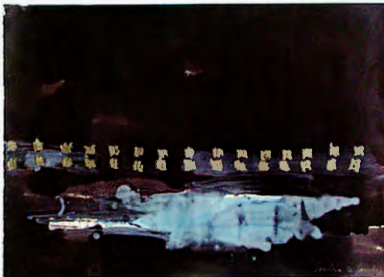
Black and Blue River, 2004, 29.5 x 41" Graphite and ink on Arches paper