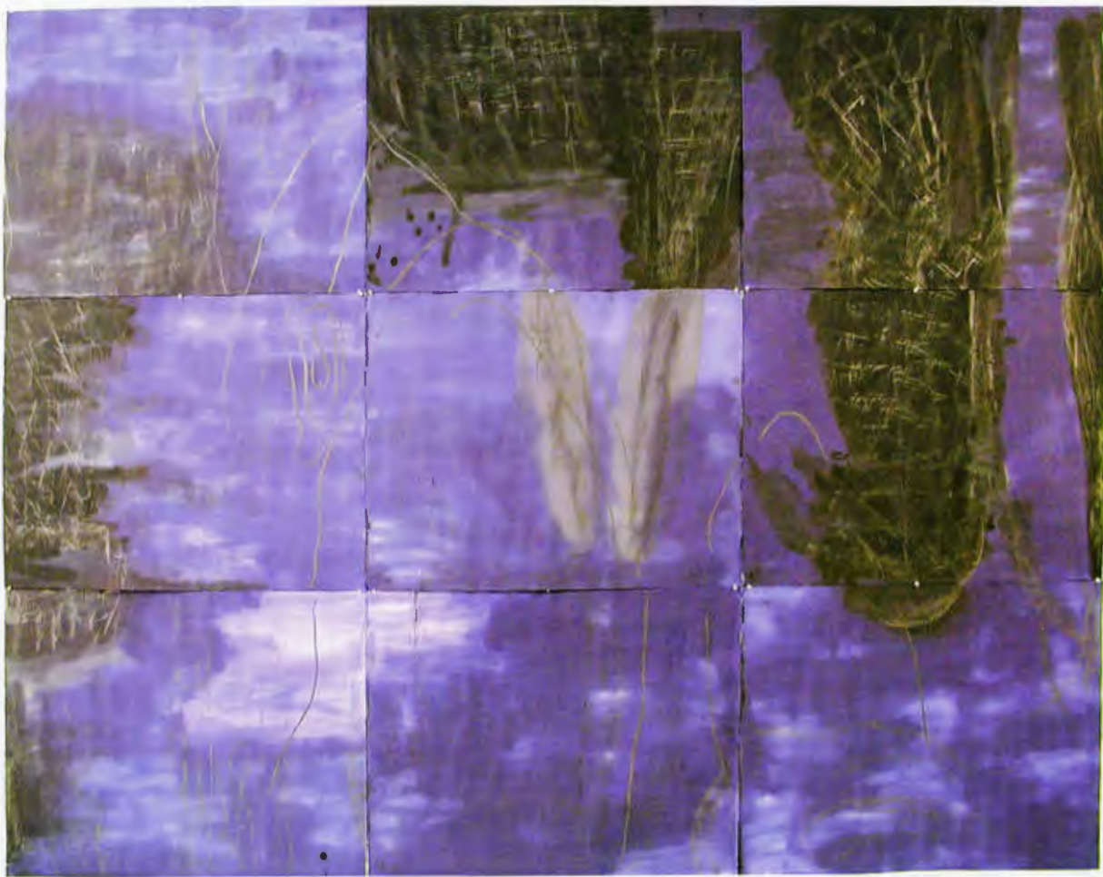
After Midnight , 2003, 89 x 123" Graphite and ink on Arches paper