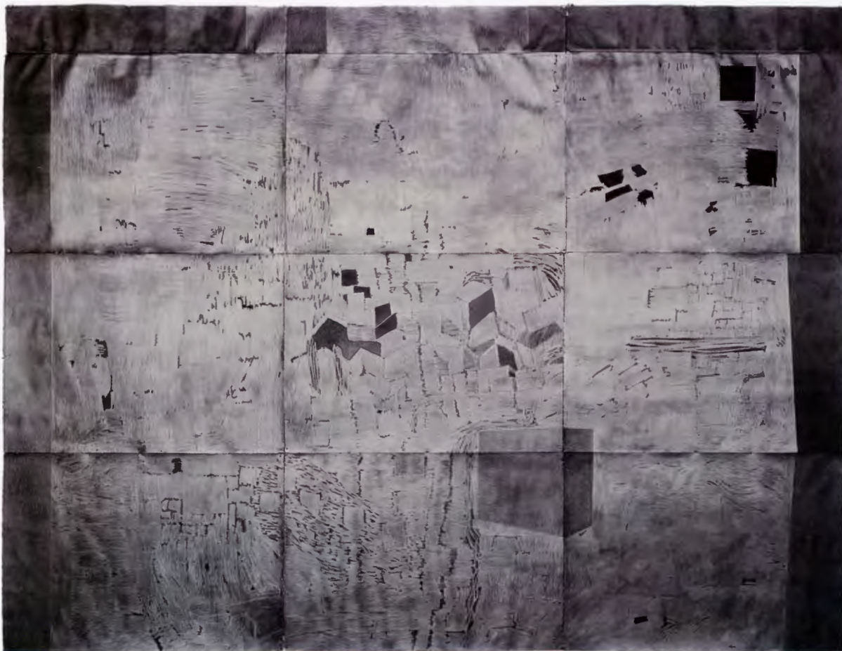
Dark I Run , 2003, 95 x 123" Graphite and ink on Arches paper