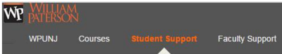
Figure 3 WPUNJ | Courses | Student Support

From within Blackboard students can access the Bb/Students section of the IT Wiki by selecting Student Support from across the top of the interface