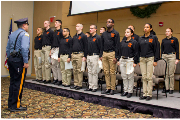
WP Pre-Police Academy Students

University Police will immediately notify the campus community or appropriate segment of the campus community upon the confirmation of a significant emergency or dangerous situation involving an immediate threat to the health or safety of students or staff occurring on the campus. In the event that University Police decide to notify a segment or segments of the campus community, the choice of this/these segment(s) will be made based on the potential for the emergency to affect the individuals who are selected.