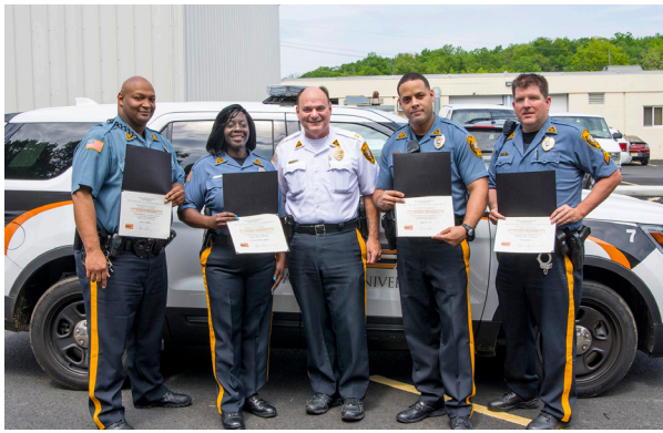
William Paterson officers receive WP Pride Care Awards for their service to the University.