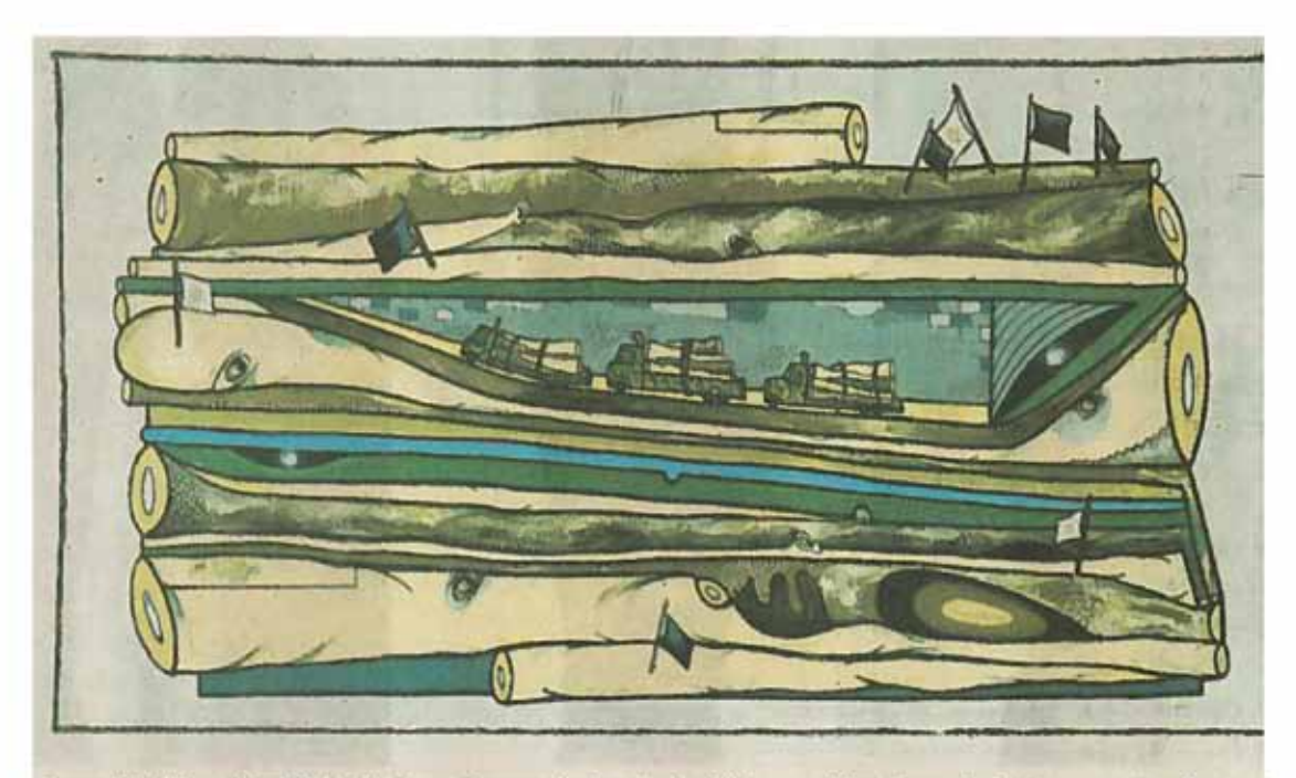
Azaceta's "Slaughter" (2010) shows human limbs stacked like wood that is ready for transport on the backs of logging trucks, depicted in the middle of the compost ion.