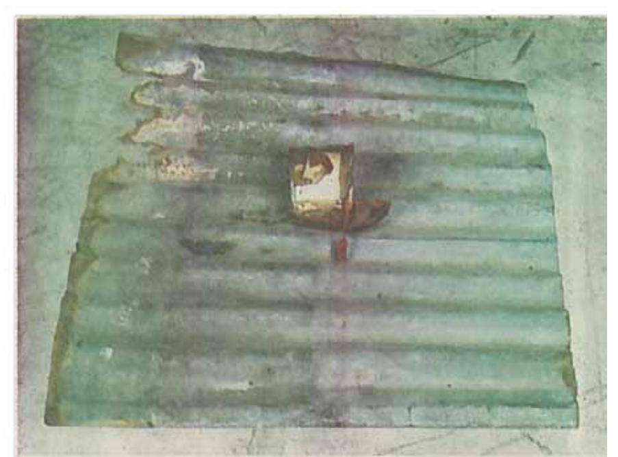
"Drifting" (1998) is a mixed-media installation consisting of rusting tin, which represents water, with a small boat and a faded photo of the artist sailing across.