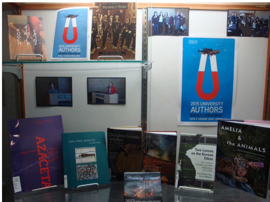
Part of the display in the Library's lobby exhibit case for the University authors' publications of 2015.

A display was created last September to coincide with the University's