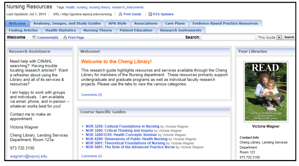
The main page of the Nursing Resources LibGuide, one of the most popular research guides made available through the Library's Website.

At the Cheng Library, the use and popularity of specific guides fluctuates during the academic year, but the nursing, public health and history guides are usually among the most popular. Guides can be created for individual courses or for general information, such as the one explaining textbook options. This guide is heavily used at the beginning of the fall and spring semesters.