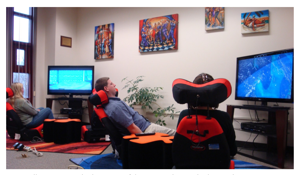
Library users enjoying some of the new equipment in the Preview Room.

During its long history on campus, the Cheng Library has experienced many "firsts" -- its first online catalog in the mid-1980s, its first student computer center in 1995 and many others. In May 2011, the Library enthusiastically embraced a significant, new first – a major monetary donation from the Student Government Association.