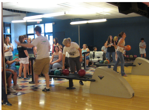
First year Honors students and their mentors went bowling on Labor Day.

Hello, I would like to welcome everyone to the University Honors College this fall! We have 73 first year students in the College, and 48 of them are living in the learning community in High Mountain East. We also have about 150 students in or moving into Tracks who have already completed several Honors general education classes.