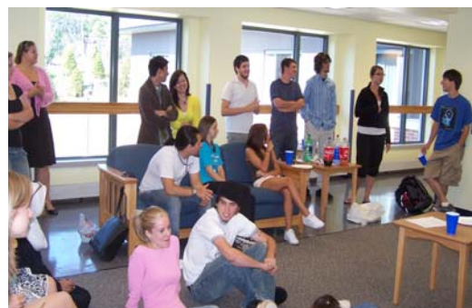
The first "Lunch in the Lounge" of the fall semester was held on September 25th.