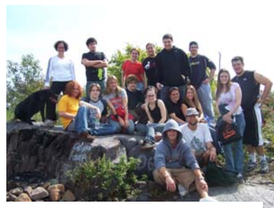
Students on High Mountain

During the fall semester, students enrolled in Honors Clusters have been enjoying a range of educational field trips in New Jersey and New York City.