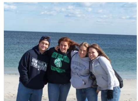
Students at Sandy Hook