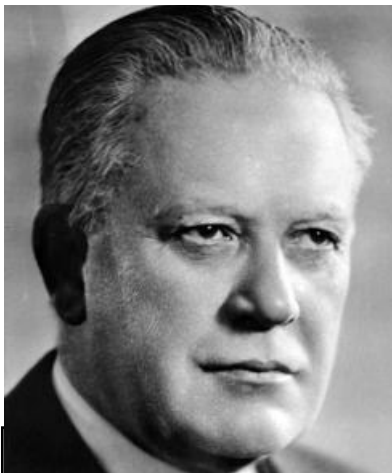
Who is this sociologist?

Graduate interns conduct evaluation research at the organization to which they are assigned. Instead of working within that setting, they first observe and then engage in an on-site analysis of a program or activity, after which they make recommendations for its improvement. In contrast, undergraduate students go through a learning-by-observing-and-doing experience in that job setting. Each puts in an average eight hours a week on site.