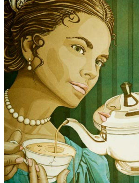
ROBIN KOSS PURCHASE PRIZE

Lady with Tea, 2011 Multiple plate etching/aquatint 20 x 15 inches