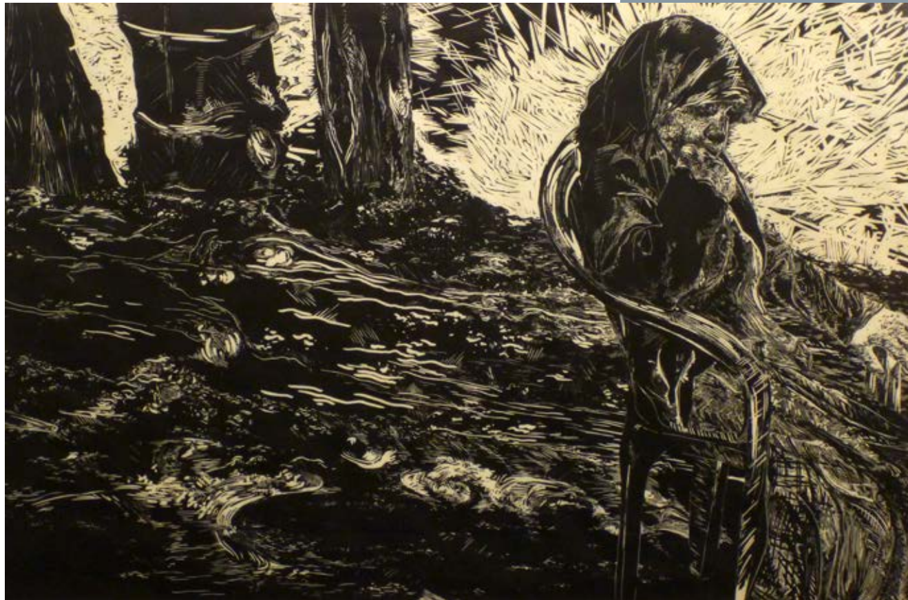
PAULA FRISCH PURCHASE PRIZE

Gunduzlu, Turkey, 2010 Linocut 24 x 36 inches