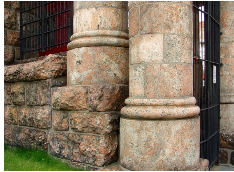
Figure 3b. Close-up of the exterior of St. Paul's Episcopal Church.

Another noteworthy use of the granite in the early 1900's was for the landing at the entrance to the Smithsonian National Museum of Natural History in Washington D.C. (fig. 4). In the spring of 1998, Smithsonian representatives contacted the New Jersey Geological