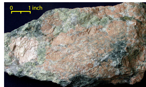
Figure 2. Representative sample of the Pompton Pink Granite displaying its characteristic color and coarse grain size.

with light green mottling and is composed of the minerals quartz (gray), potassium feldspar (pink), plagioclase feldspar (green), and magnetite (black). The granite owes its characteristic color to an abundance of potassium feldspar that makes up much of the rock. The source of the magma that formed the granite was the continental crust beneath the New Jersey Highlands. Following a mountain-building event produced by the collision of the ancestral eastern North American and South American