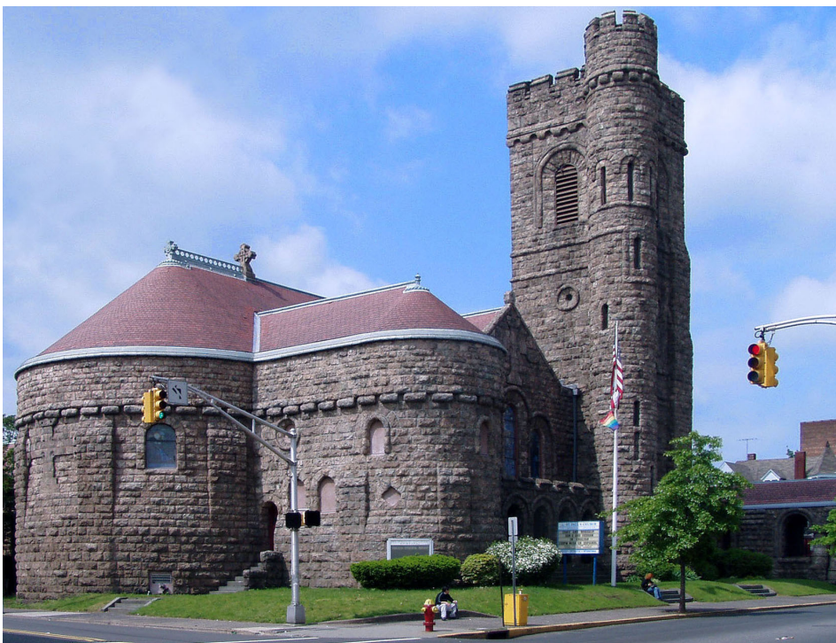
Figure 3a. St. Paul's Episcopal Church in Paterson, constructed of Pompton Pink Granite.