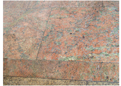
Figure 4. Pompton Pink Granite forming the landing at the south entrance to the Smithsonian National Museum of Natural History, Washington, D.C.

Despite, or perhaps because of, the small amount of Pompton Pink