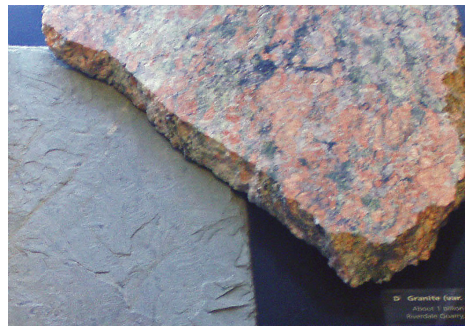
Figure 5. Polished slab of Pompton Pink Granite (upper right) on display at the Smithsonian National Museum of Natural History's exhibit on the building stones used in construction of the museum.

Granite that existed within the New Jersey Highlands, the desirability of this very attractive stone cannot be overstated and serves to remind us of the proverb that sometimes "good things come in small packages."