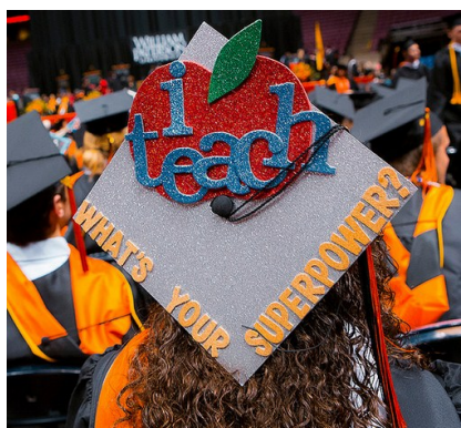
Colorful and creative mortarboards added a whimsical touch to the ceremony.