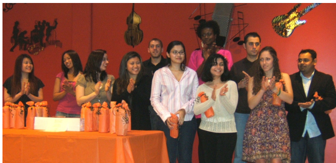
Some of our May 2009 Biology graduates at the 2009 Biology Year-End Ceremony