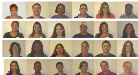
2009-2010 ISSBB Scholars

meant to defray the cost of education for Science, Engineering and Math majors who are going into research or teaching careers, and can cover all expenses.