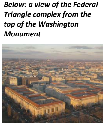
Below: a view of the Federal Triangle complex from the top of the Washington Monument