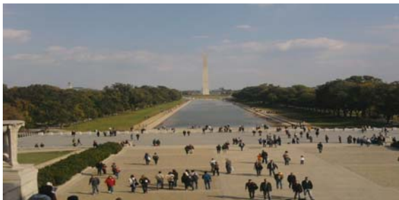
Left, a picture of the Washington Monument