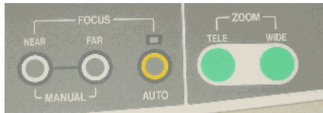
Zoom, Auto, & Focus Buttons

Step 7: When finished using the Document Camera, please turn the Document Camera power switch off.