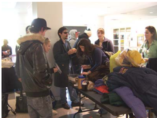
Members of the Honors Student Club hosted the second annual Honors Coat Drive in November.

Last semester ended on a positive note as members of the Honors Student Club collected over 200 coats and donated them to shelters in and around the city of Paterson. The Honors Club would like to thank the entire University community for their generous support of the second annual Honors Coat Drive.