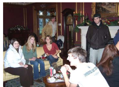
Honors students enjoyed the annual Holiday Party in Hobart Manor.

Please note that advisement for the fall 2008 semester will begin next month, followed by registration at the beginning of April. A complete listing of Honors General Education Courses and Honors Track courses will be available soon. Be sure to watch for email updates pertaining to Honors classes, advisement and registration.