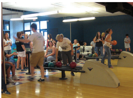
First year Honors students and their mentors went bowling on Labor Day.

Hello, I would like to welcome everyone to the University Honors College this fall! We have 73 first year students in the College, and 48 of them are living in the learning community in High Mountain East. We also have about 150 students in or moving into Tracks who have already completed several Honors general education classes.