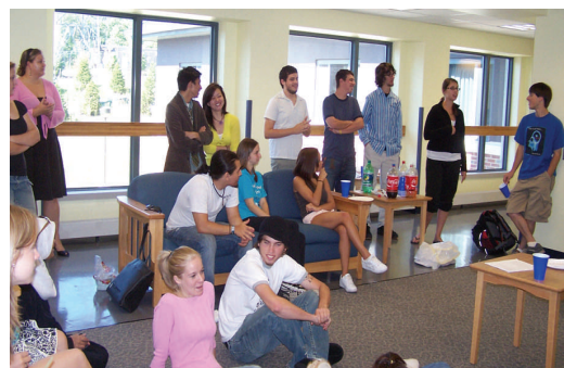
The first "Lunch in the Lounge" of the fall semester was held on September 25th.