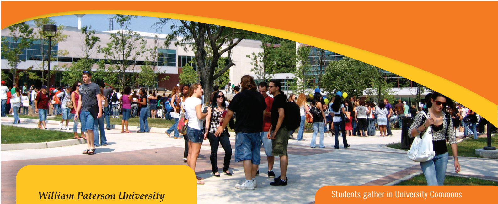
Students gather in University Commons