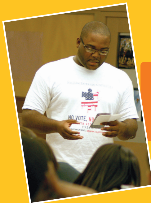
A University student discussing voter registration at Paterson's Kennedy High School