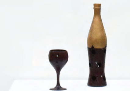
Opposite Page, Top | Untitled (Manuel Pina Babbitt), 2003 | Cast iron | 3 x 14 x 10 inches | Courtesy Frederieke Taylor Gallery, New York, NY | Opposite Page, Bottom | Untitled (Timothy McVeigh), 2002 | Bronze, ice cream, and dry ice | 6 x 12 x 9 inches | Courtesy Frederieke Taylor Gallery, New York, NY | This Page | Installation view, Breaking Bread: Artists Explore Food Practices , 2017 | William Paterson University, Wayne, NJ