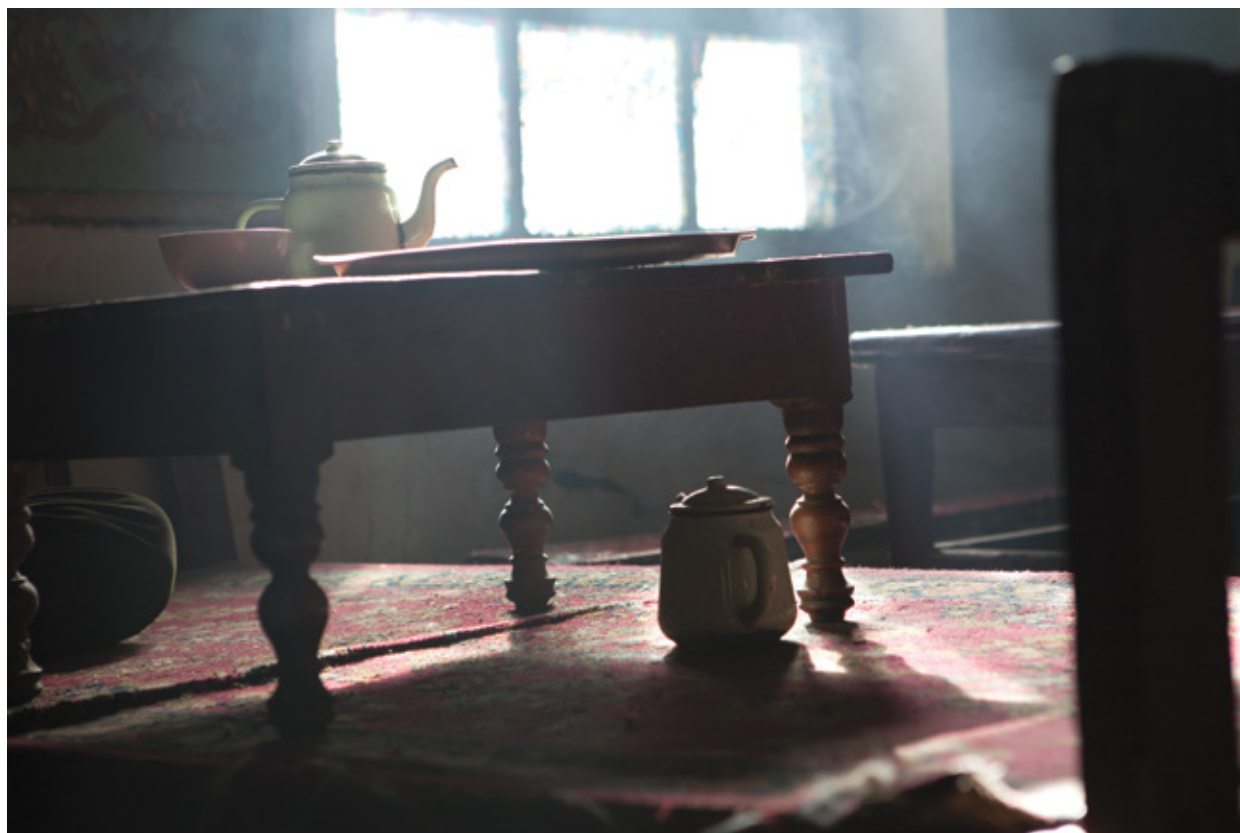
A Corner of a Teahouse with Worn Table and Teapots. Kashgar, Xinjiang, China

2011 • Photograph 11 3/4 x 17 3/4 inches Courtesy of the artist