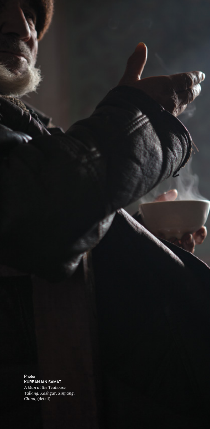
A Man at the Teahouse Talking, Kashgar, Xinjiang, China, (detail)

these migrants, who are mostly construction workers, agricultural laborers, and market vendors' employees, and documents their daily lives at work sites and residential quarters. He prefers black and white photos that direct focus on their subjects and emphasize the way that workers literally must live in the shadows. Here are his own words about his project: