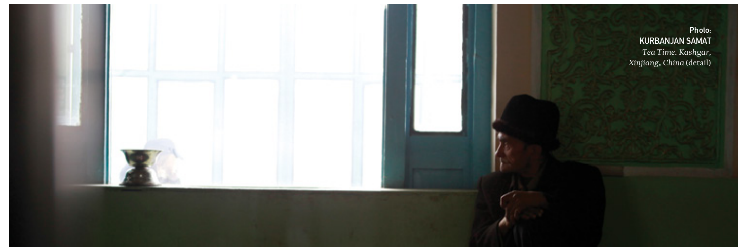
Tea Time, Kashgar, Xinjiang, China (detail)