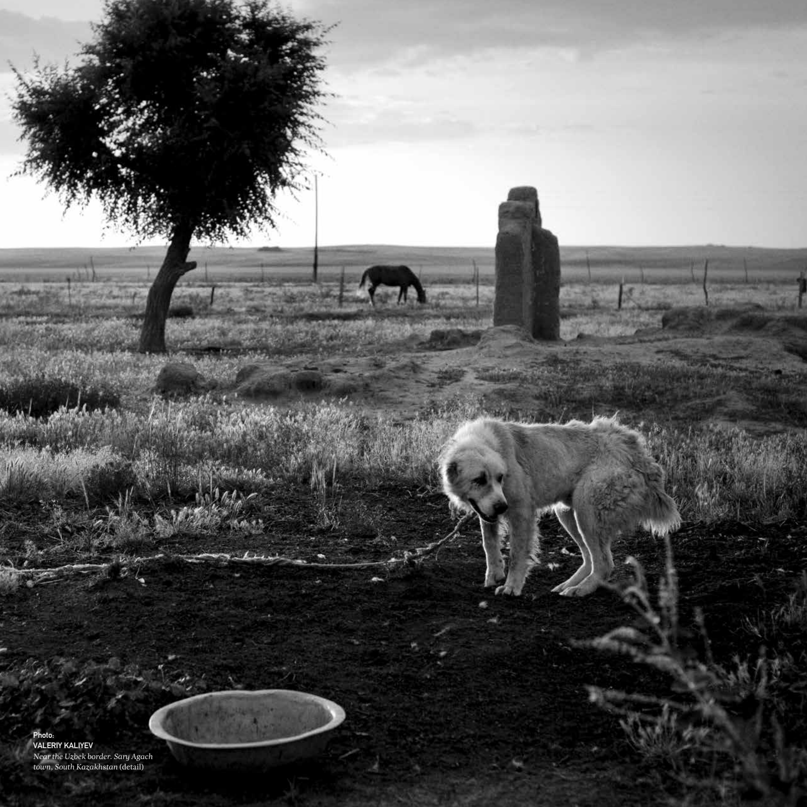
Near the Uzbek border. Sary Agach town, South Kazakhstan (detail)