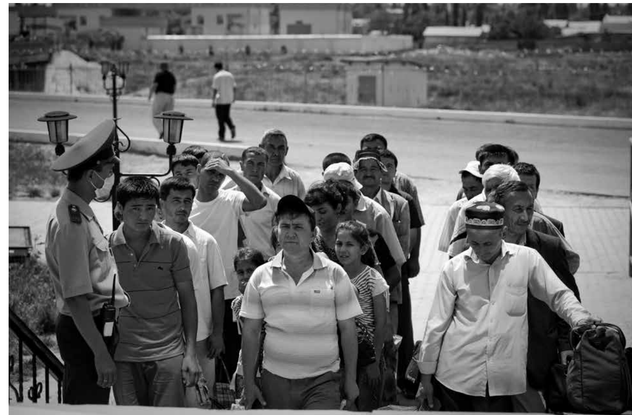
People from Uzbekistan are crossing the border to Kazakhstan. Sary Agach town, Kazakhstan. Uzbek – Kazakh border

June 2010 • Photograph 20 x 30 inches