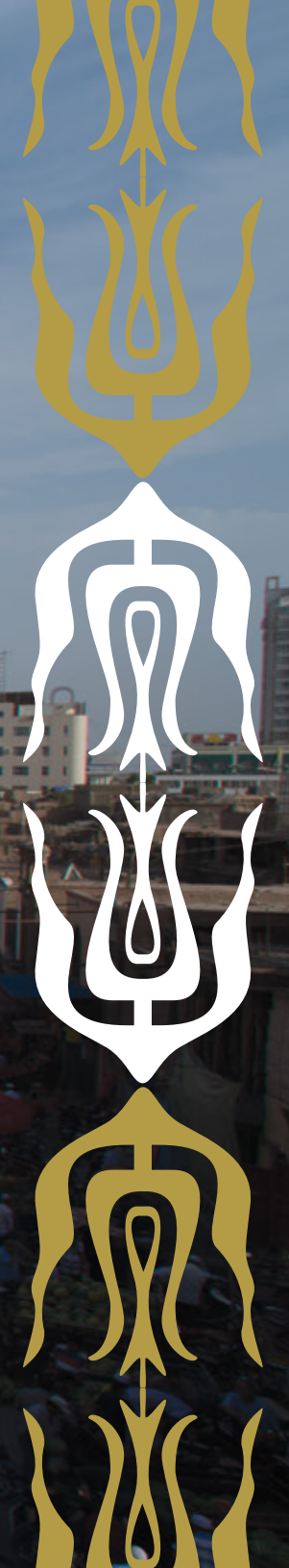
The Last Old Teahouse in Kashgar, Kashgar, Xinjiang, China, (detail)