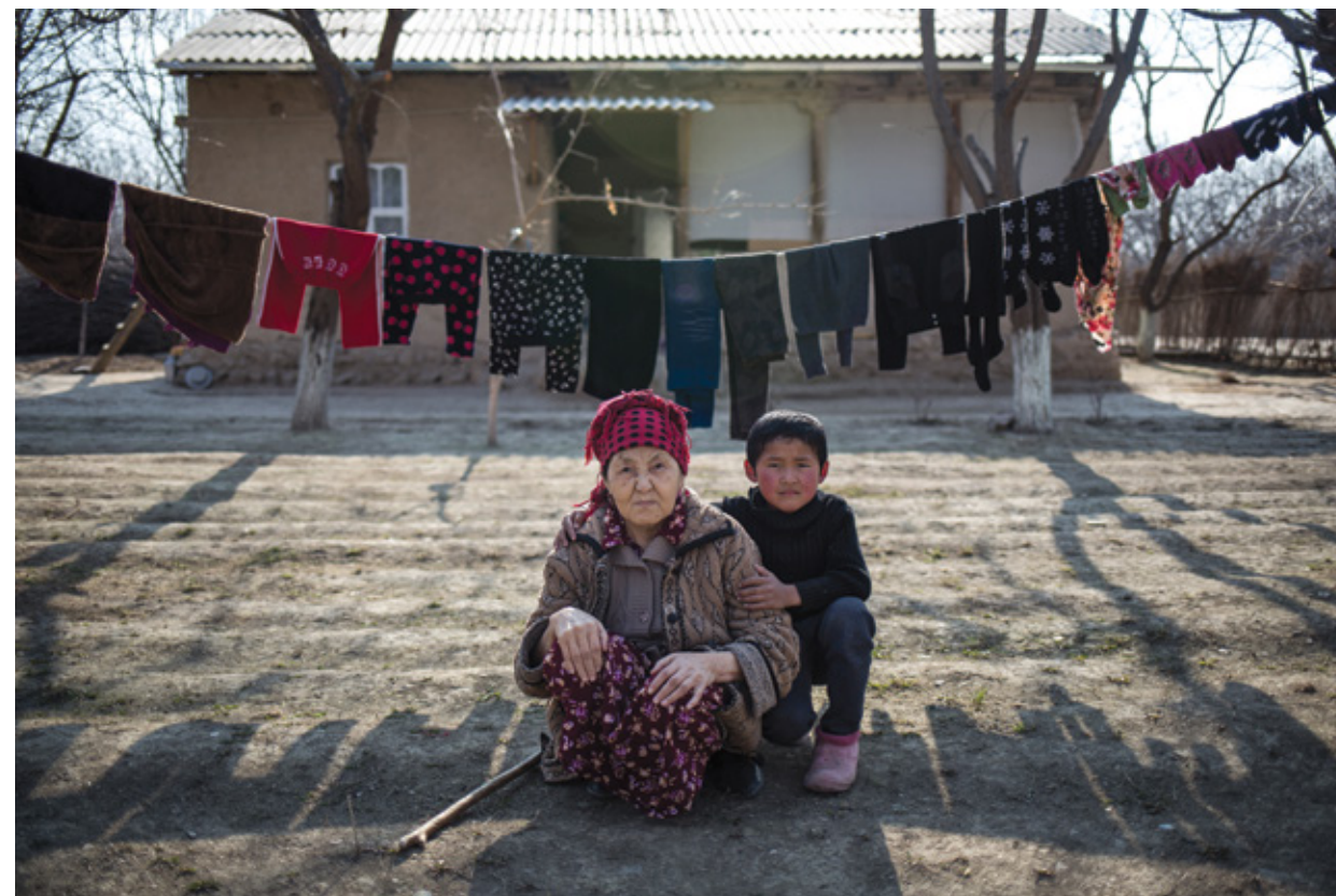
Sixty-year-old Ainysa and her six-year-old grandson. Chek village, Batken oblast

2015 • Photograph 12 1/4 x 18 1/2 inches