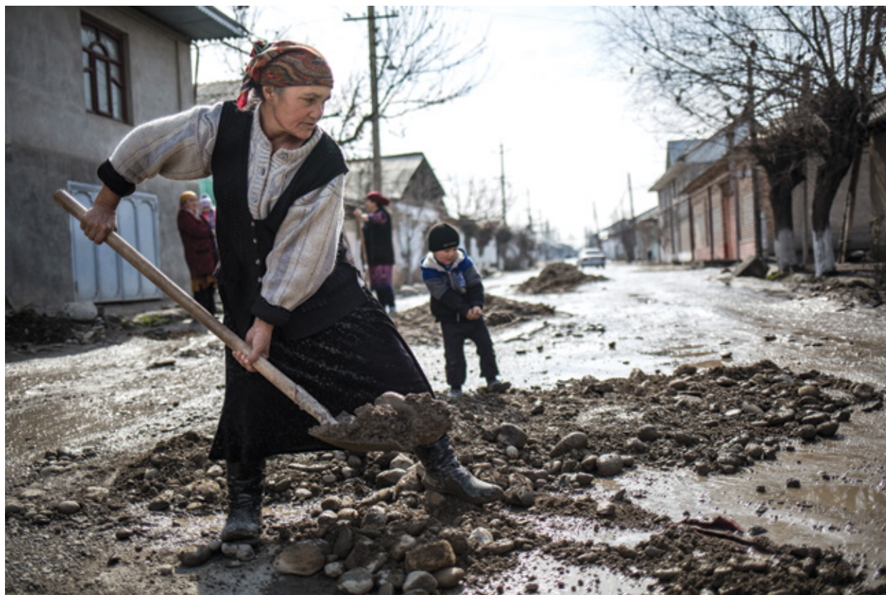
An elderly woman shovels mud from a destroyed road near her house. Osh city, Osh oblast

2015 • Photograph 12 1/4 x 18 1/2 inches