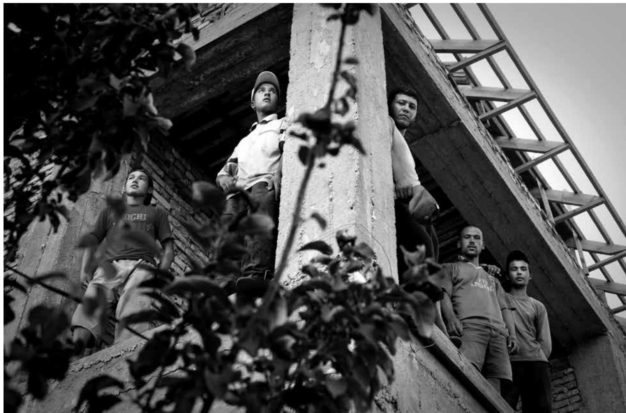
A group of construction workers from Kokand, Uzbekistan pose on the second floor of a house under construction for a local businessman. Zhetysay town, South Kazakhstan

June 2010 • Photograph 20 x 30 inches