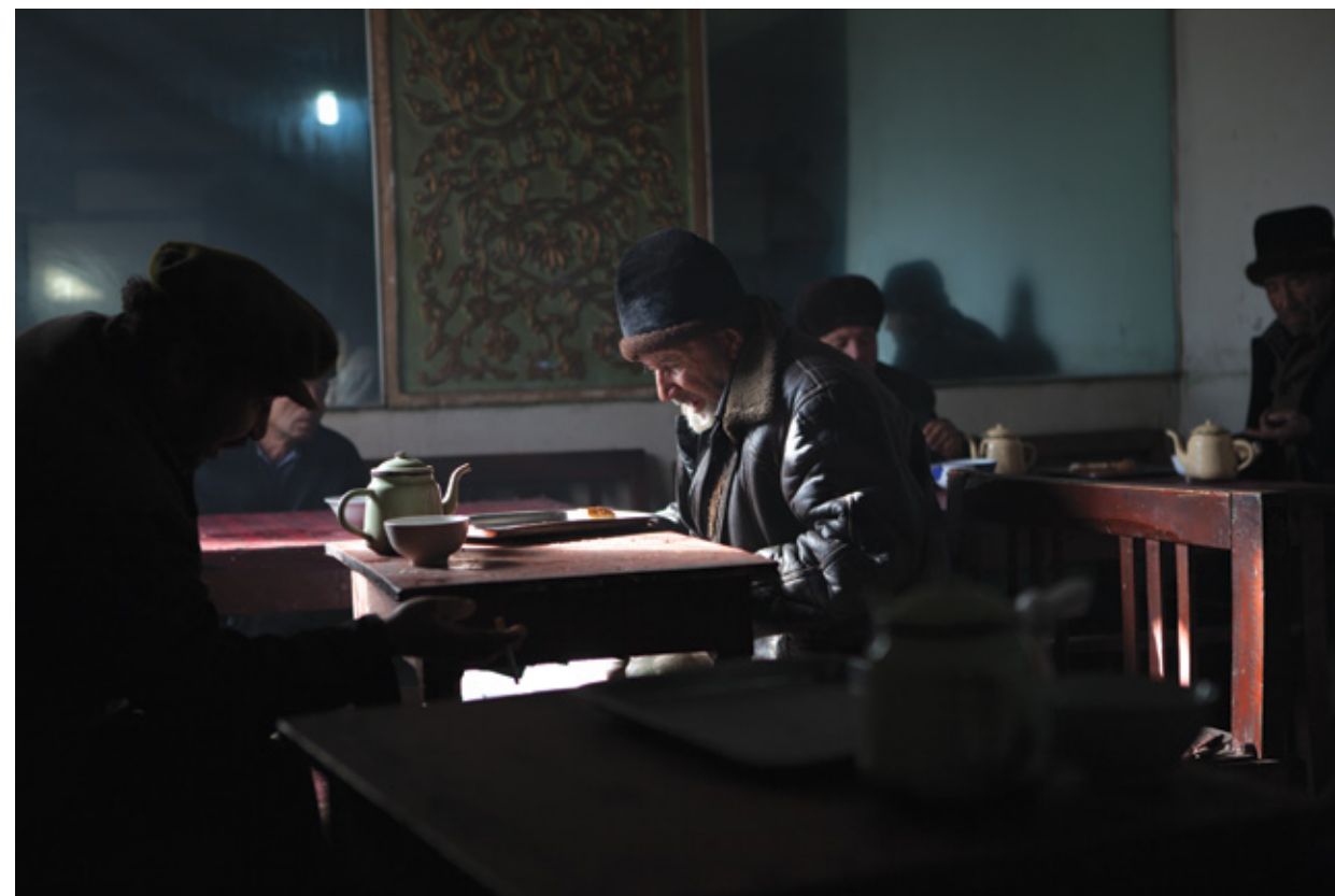
A Quiet Afternoon at a Teahouse. Kashgar, Xinjiang, China

2011 • Photograph 11 3/4 x 17 3/4 inches