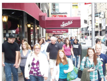
Students going to the exhibit