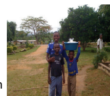
Young boys smiling for the camera