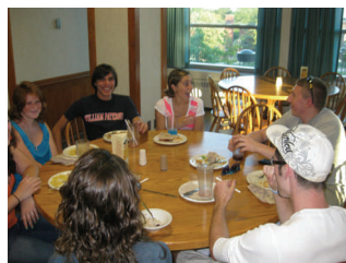
Mentors and First Year Honors students enjoying dinner in Wayne Hall