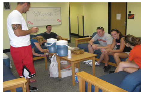
Honors Students taking a break on move-in day.