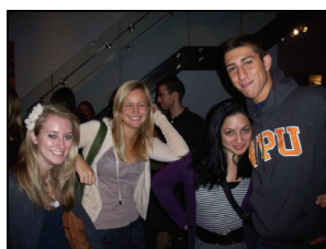
Students in line for King Tut

After everyone got settled on campus, the Honors Club organized a trip to the Discovery Times Square exhibit in New York to see King Tut with plenty of time afterwards to admire the city.