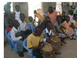
Local families singing and playing instruments