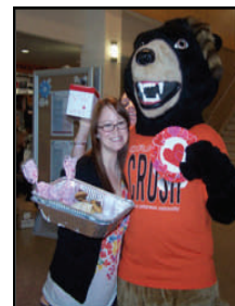
Members of the campus community participating in "Hugs for Haiti," by donating money for a hug from Billy the Bear, WPU's mascot.