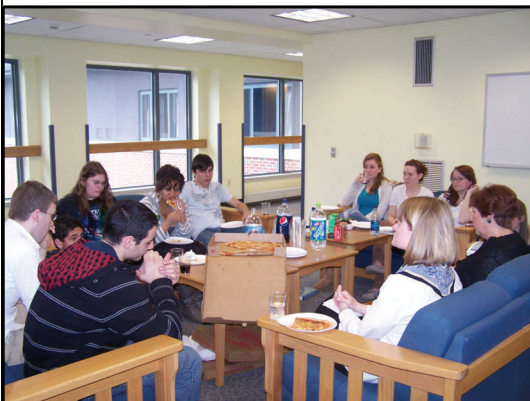
Honors students enjoying pizza while receiving information about the advisement center.