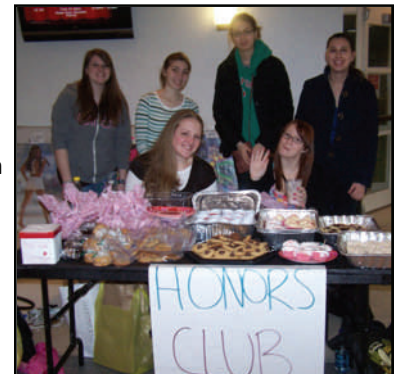
Honors Club members volunteering at the sale.

The Honors Club sponsored another Bake Sale on March 1 to raise money for the "Great American Bake Sale," an organization devoted to ending childhood hunger by providing children and their families with nutritious meals. The Honors Club appreciates the outpouring of support by members of the University Community. A special thanks to those who donated baked goods, volunteered their time at the events, and/or purchased baked goods.