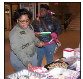
WPU students purchasing baked goods.