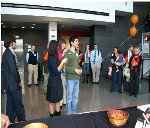
Alumni preparing to tour campus